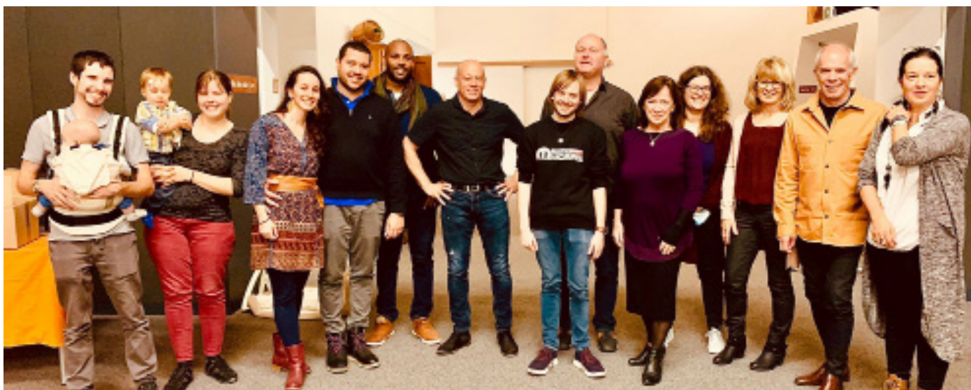
Staff of the Seminar in Tavannes Nov. 21

Here we have some testimonies from participants who experienced the gentle and powerful touch of the heavenly Father.